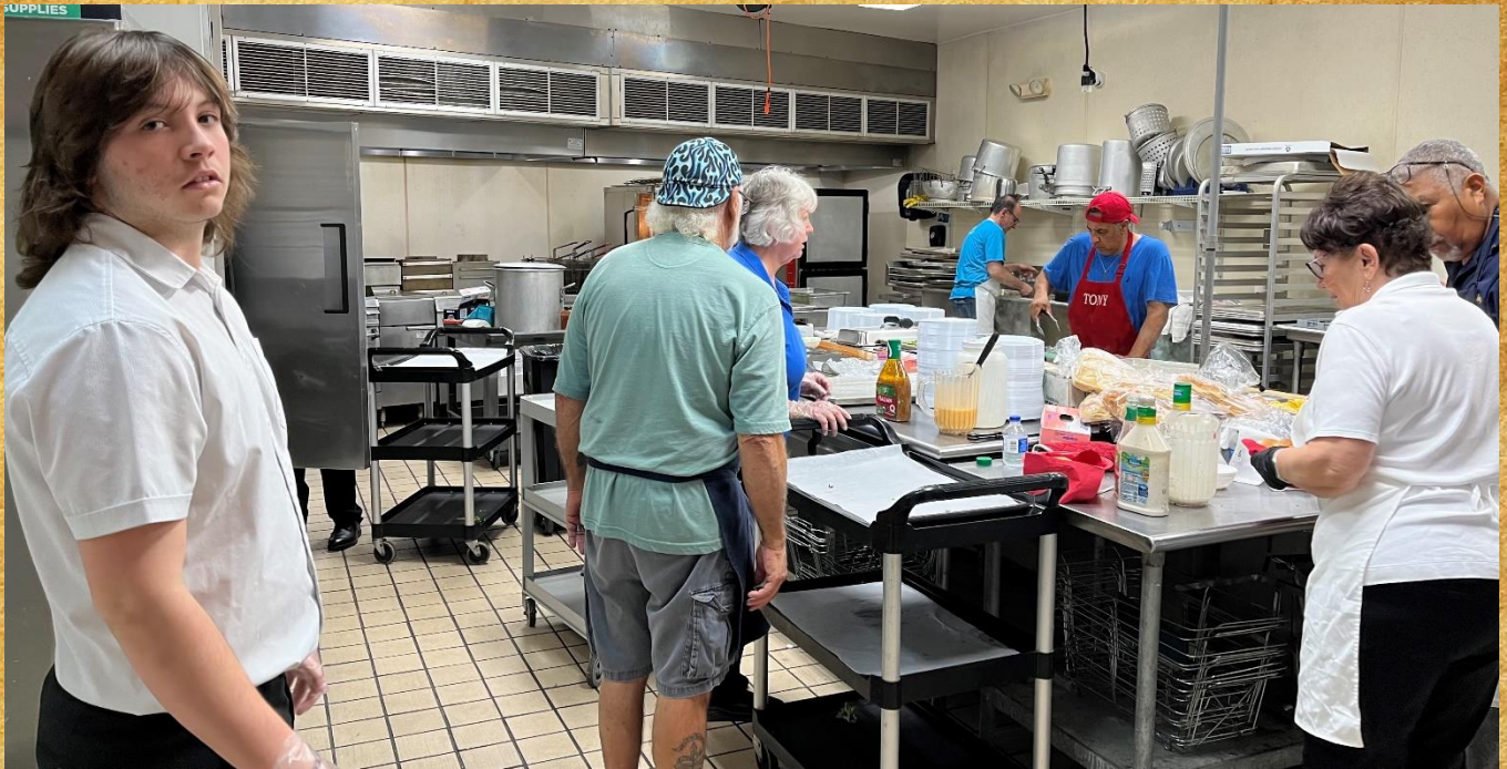
Kitchen Crew for the Valentine Dinner